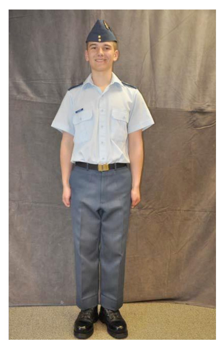
During summer dress periods you will not wear your tunic or tie. (C-2B).

Winter dress period begins in mid-October and ends at the end of May. Check the squadron announcements for the proper order of dress every week.