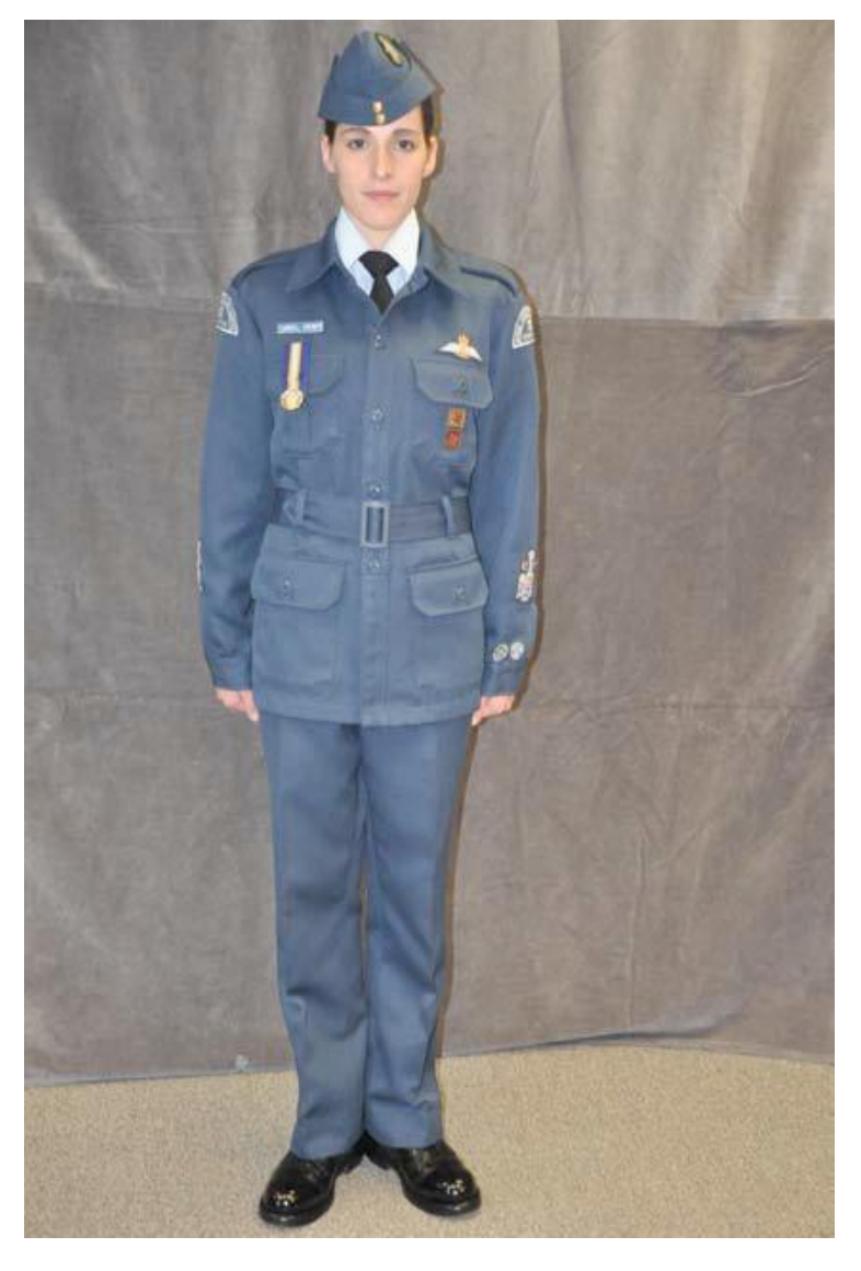
Here is a cadet in full uniform (C1). This is what you will wear on CO's parades and other important parades and events.

On regular training nights when we are in winter dress you will wear the same uniform, but cadets with medals will only wear the ribbons (C2).