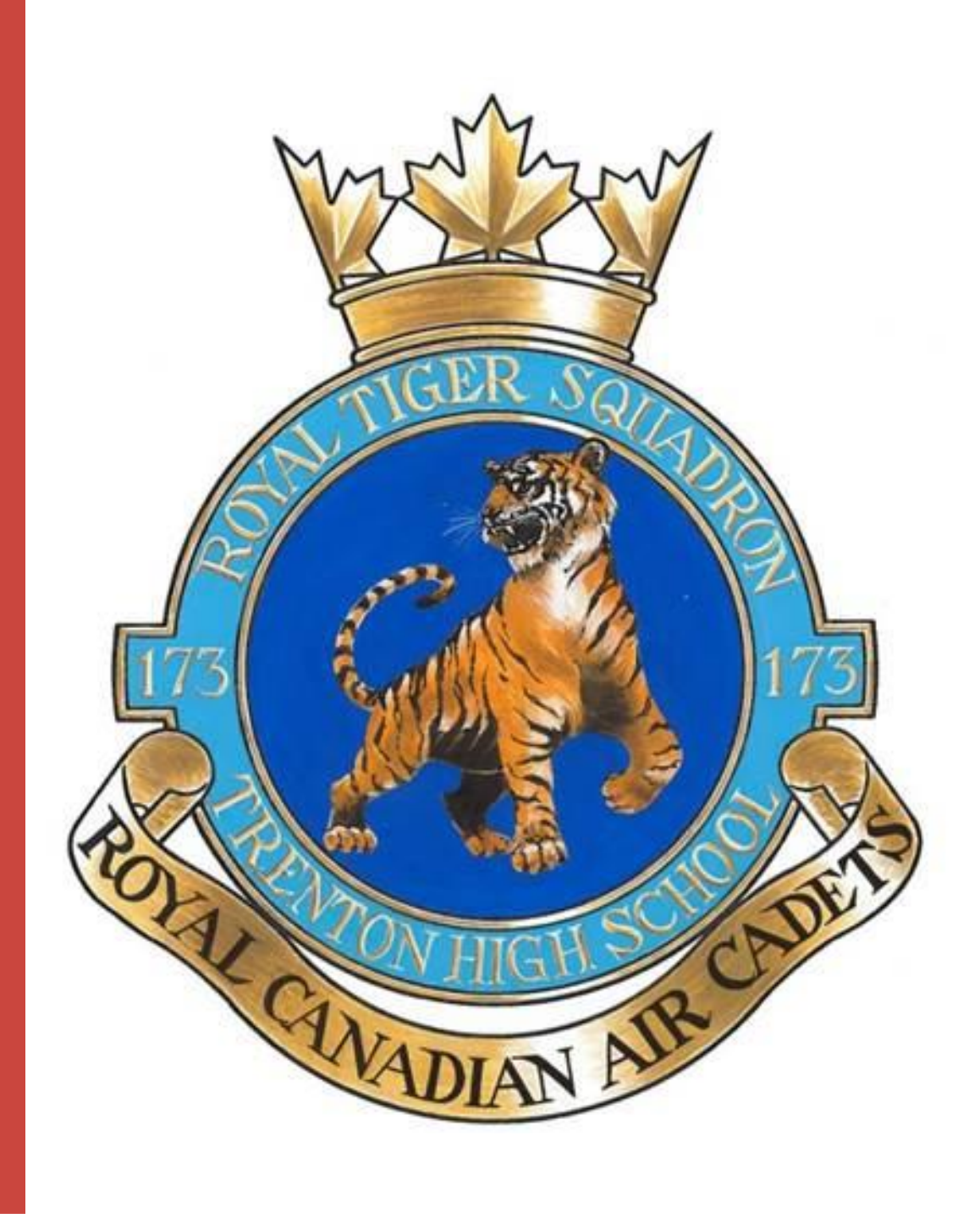
Uniform Guide Information for new recruits